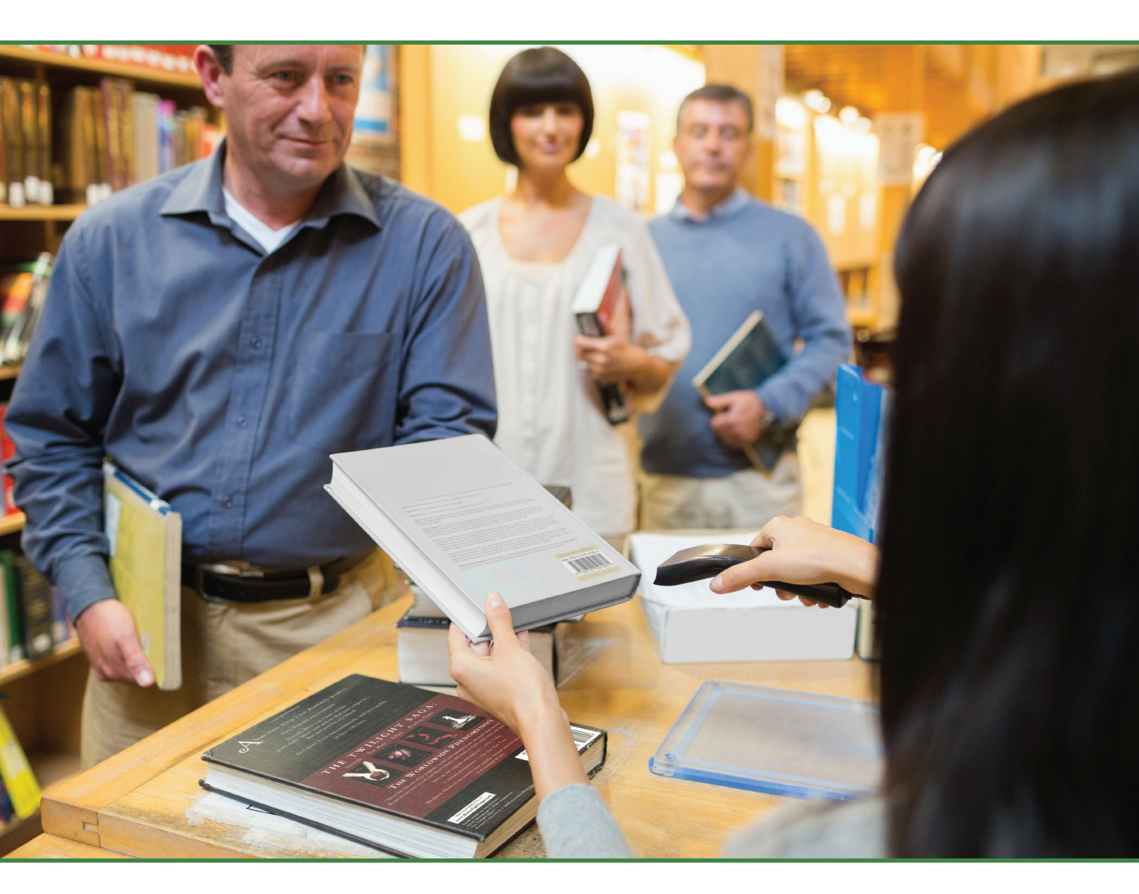
Give them a reason to keep coming back.

Brodart's McNaughton® lease plans help you satisfy patron demand for popular materials.